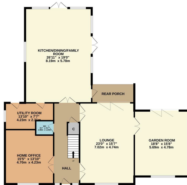
GROUND FLOOR 1714 sq.ft. (159.3 sq.m.) approx.