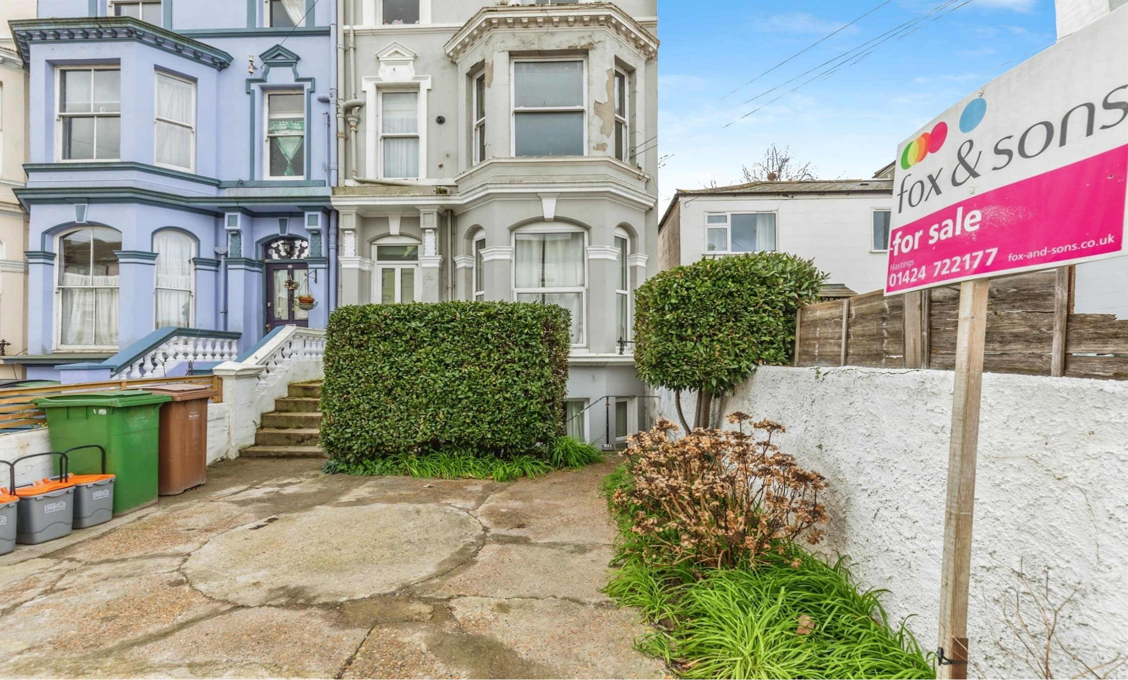
Garden Flat Elphinstone Road, Hastings TN34 2EG