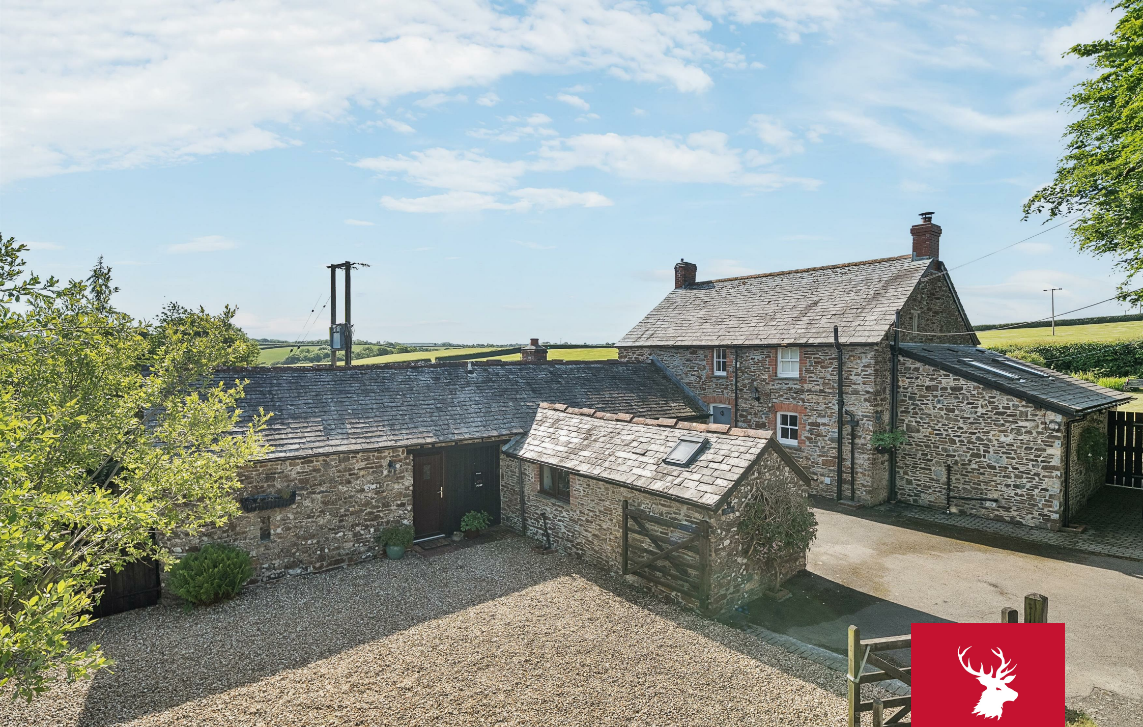
The Park House