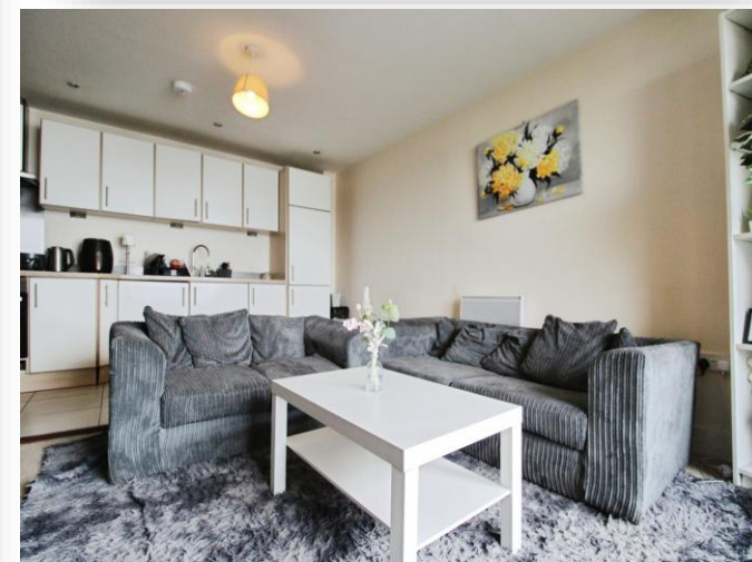
Alderney House, Ferry Court, Cardiff, CF11 0JT