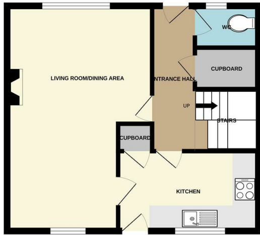
GROUND FLOOR 443 sq.ft. (41.1 sq.m.) approx.