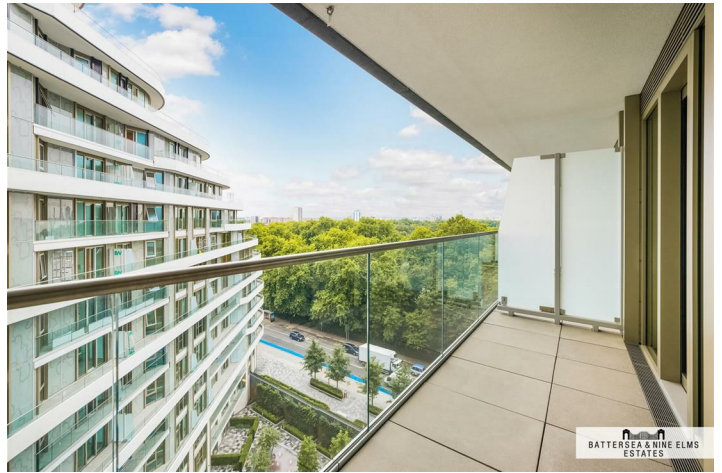
BATTERSEA & NINE ELMS ESTATES