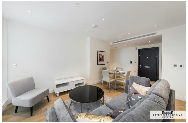
BATTERSEA & NINE ELMS ESTATES