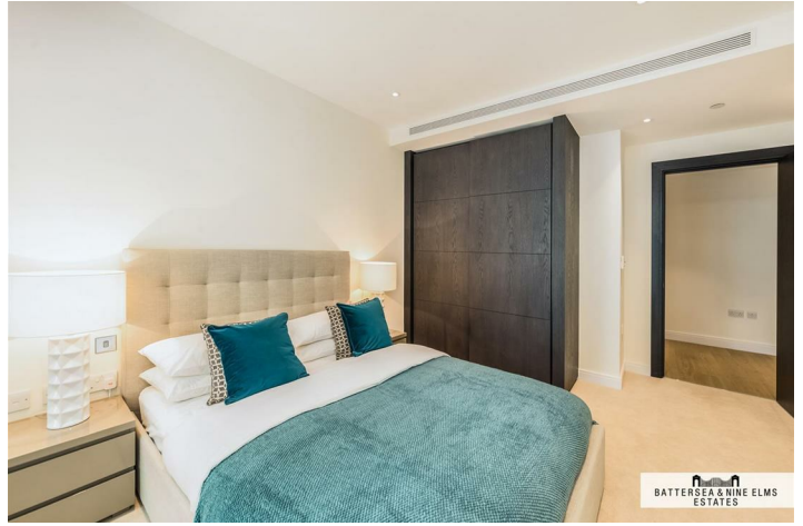
BATTERSEA & NINE ELMS ESTATES