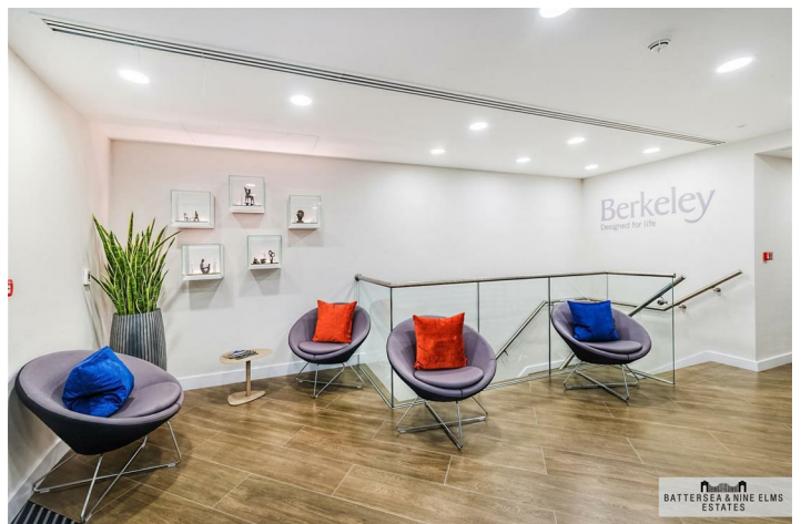
BATTERSEA & NINE ELMS ESTATES