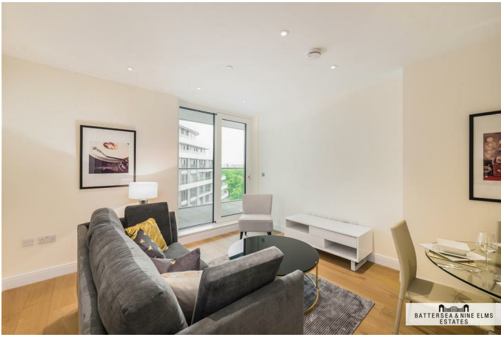
BATTERSEA & NINE ELMS ESTATES