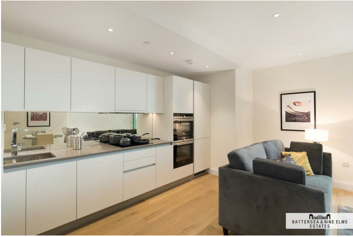
BATTERSEA & NINE ELMS ESTATES