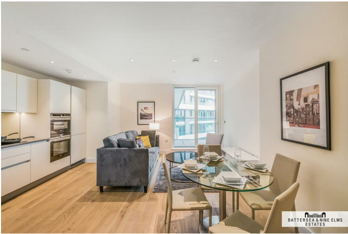
BATTERSEA & NINE ELMS ESTATES