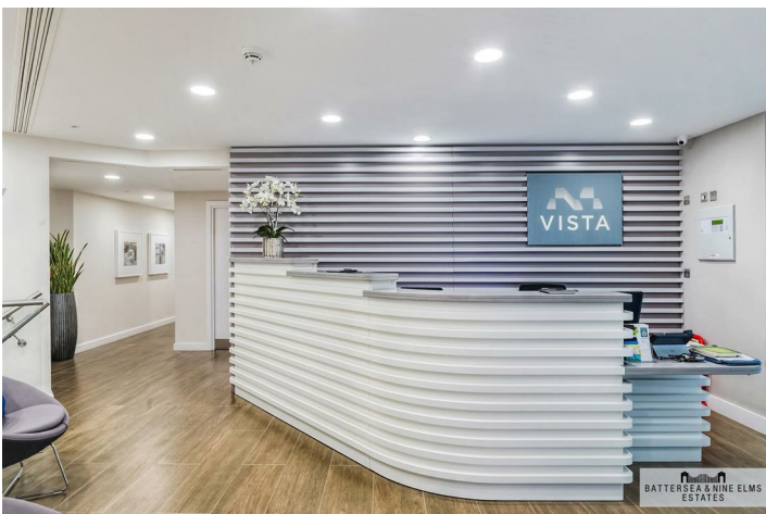
BATTERSEA & NINE ELMS ESTATES