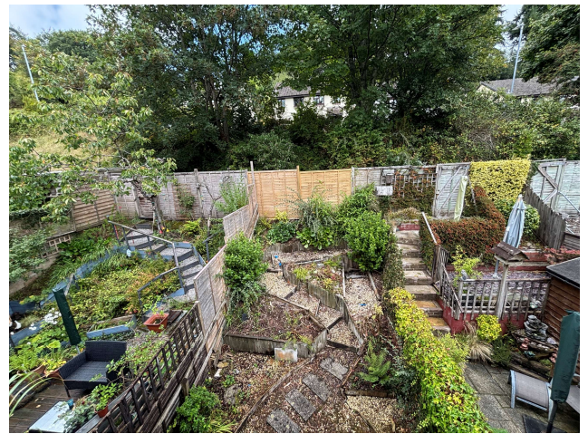
OVERVIEW OF GARDEN FROM FIRST FLOOR