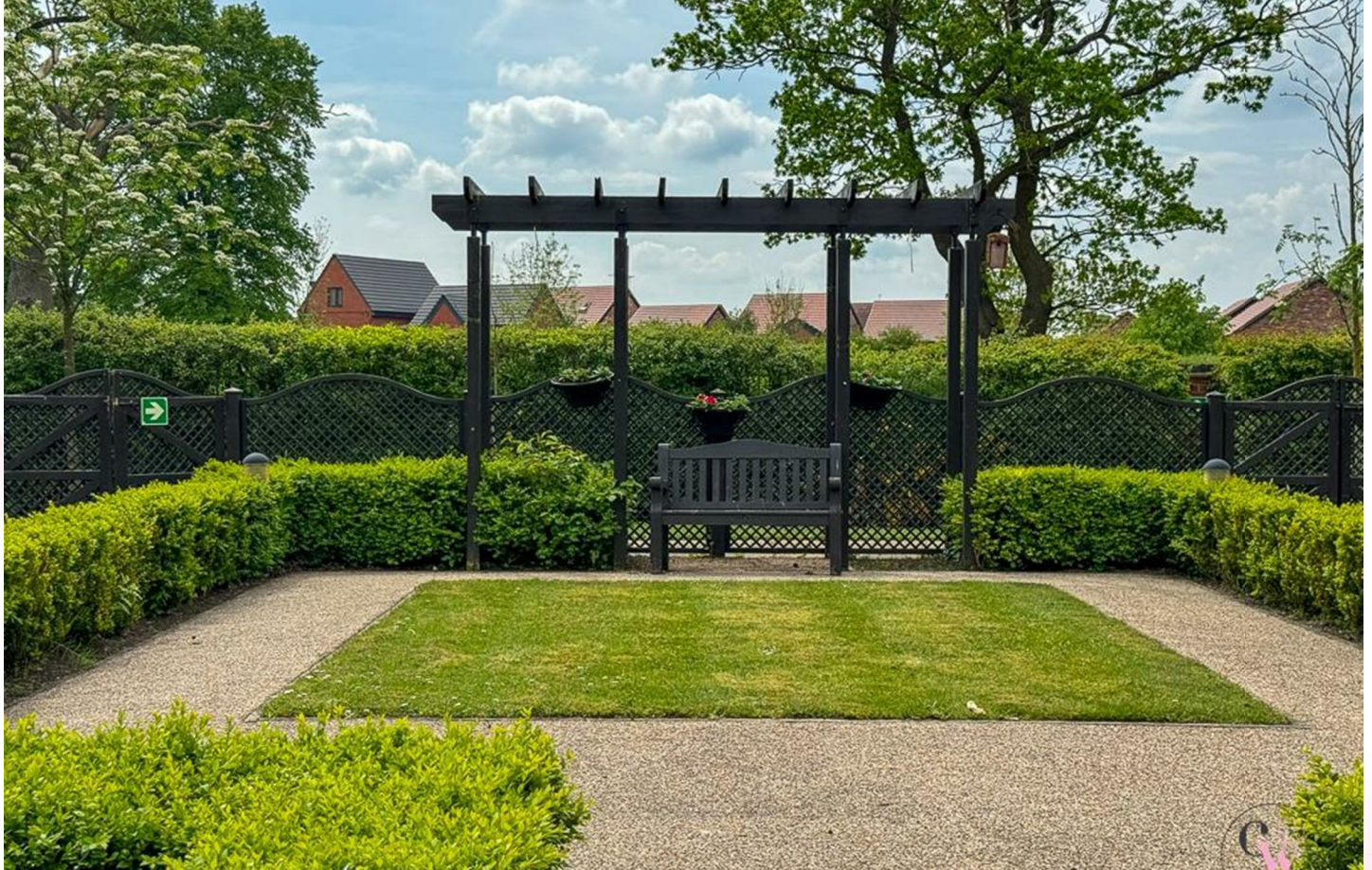
Hazelmere, Hambleton Way, Winsford CW7 1TL