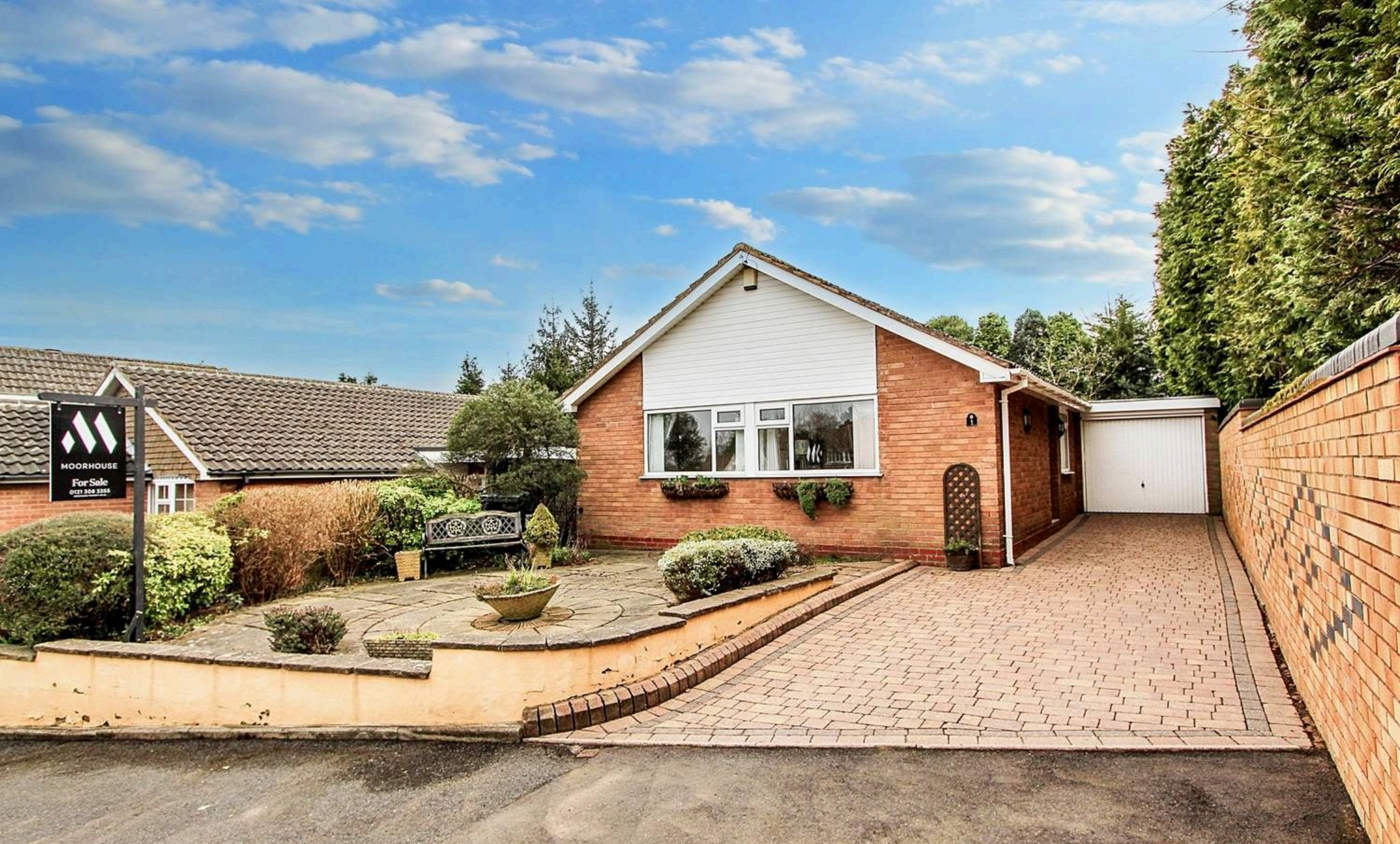
Bramcote Rise, Sutton Coldfield - B75 6ED £430,000