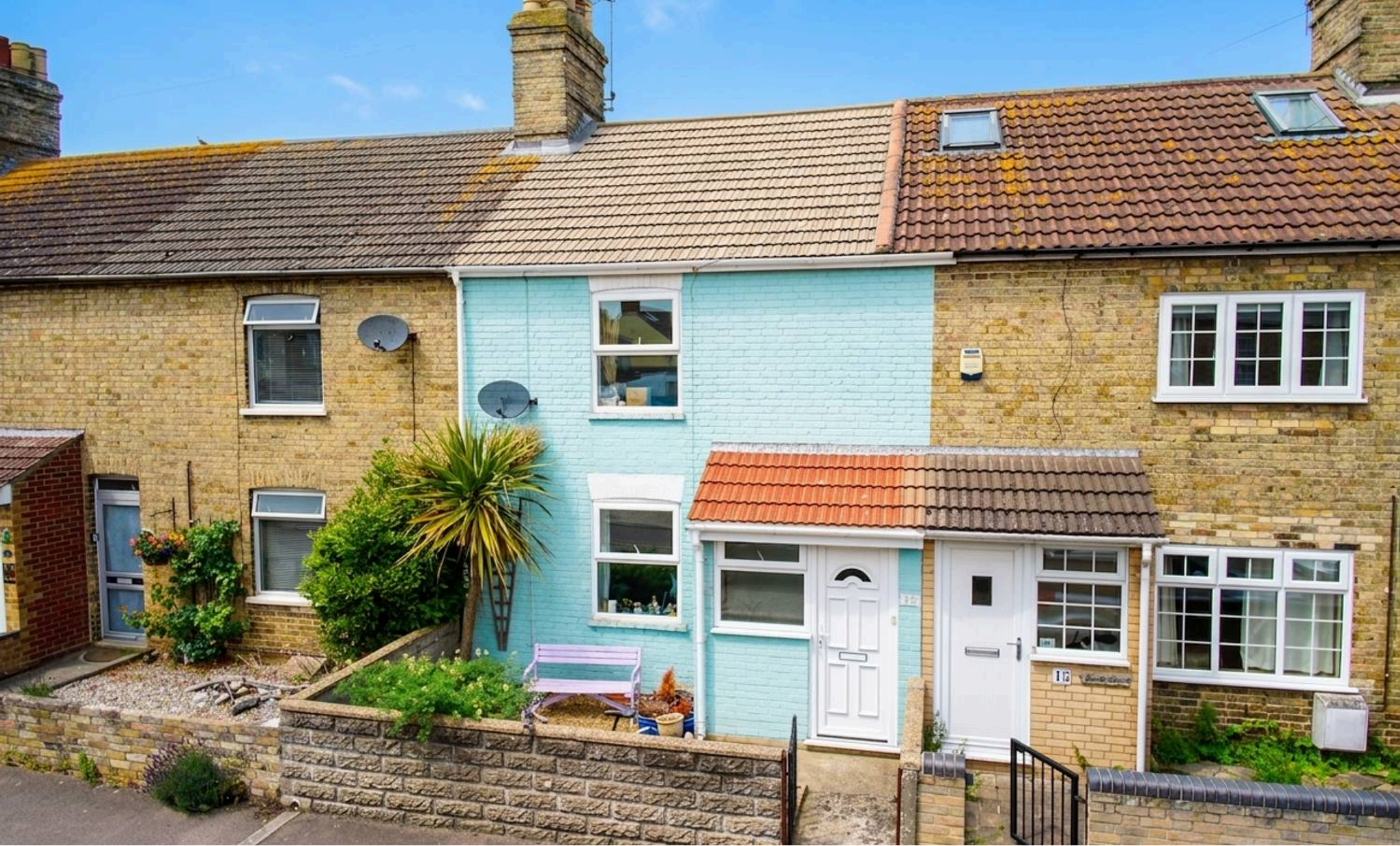
Prospect Place, Lowestoft - NR33 7DA