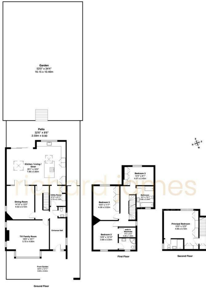
Limes Avenue, NW7 Total Gross Area: 2260 sqm ... 210.0 m 2 All measurements are approximate and do not constitute a guarantee of accuracy. They are for guidance only and should be verified by a professional surveyor. Compliant with the RICS code of marketing practice.

As agents we have not tested any apparatus, equipment, fixtures, fittings or services, and so cannot verify that they are in working order or fit for the purpose. As a buyer you are advised to obtain verification from your Solicitor/Conveyancer or Surveyor, if there are any points of particular importance to you. Reference to the tenure of the property is based on information given to us by the seller, as we well not have had sight of the title documents. You are advised to obtain verification from your Solicitor/Conveyancer. Before viewing a property, do please check with us as to its availability, and also request clarification or information on any points of particular interest to you, to save you any possible wasted journeys. Also, photographs are for illustration only and may depict items which are not for sale or included in the sale of the property. All sizes are approximate; all dimensions include wardrobe space where applicable. While we believe that the area of the property has been accurately calculated, any prospective buyer who considers this feature to be particularly important is strongly recommended to have the site measurements checked by their own surveyor before submitting an offer to purchase.