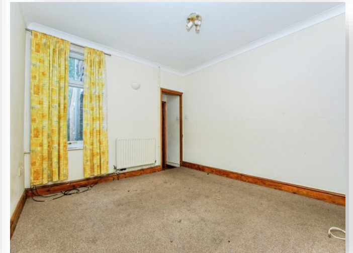
Clarence Road, Wisbech PE13 2ED