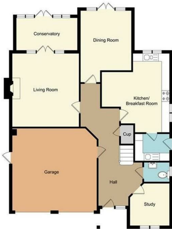
Ground Floor Approximate Floor Area 1291.02 sq. ft. (119.94 sq. m)