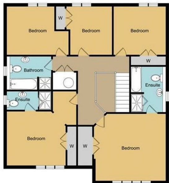
First Floor Approximate Floor Area 1120.2 sq. ft. (104.07 sq. m)

TOTAL APPROX FLOOR AREA 2411.22 SQ. FT. (AREA 224.01 SQ. M) Measurements are approximate. Not to scale. Illustrative purposes only.