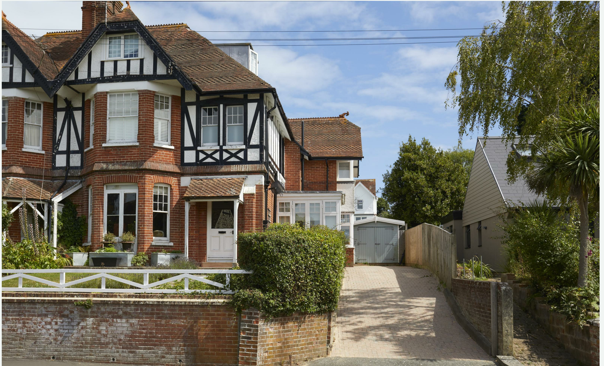
Old Orchard Steyne Road, Seaview, Isle of Wight, PO34 5BH