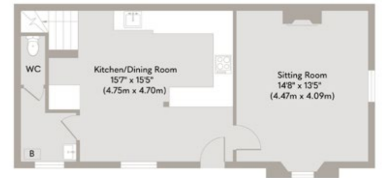
Ground Floor Approximate Floor Area 548 sq. ft (50.95 sq. m)

Whilst every attempt has been made to ensure the accuracy of the floor plan contained here, measurements of doors, windows, rooms and any other items are approximate and no responsibility is taken for any error, omission, or mis-statement. This plan is for illustrative purposes only and should be used as such by any prospective purchaser or tenant. The services, systems and appliances shown have not been tested and no guarantee as to their operability or efficiency can be given.