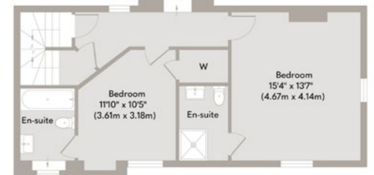
First Floor Approximate Floor Area 555 sq. ft (51.54 sq. m)