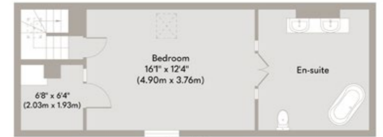
Second Floor Approximate Floor Area 436 sq. ft (40.48 sq. m)