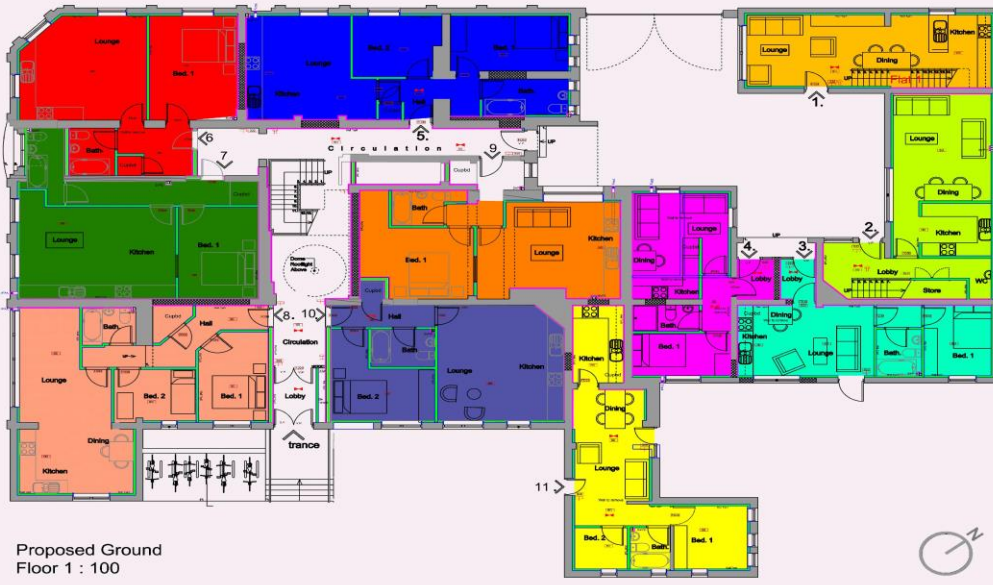
Proposed Ground Floor 1 : 100