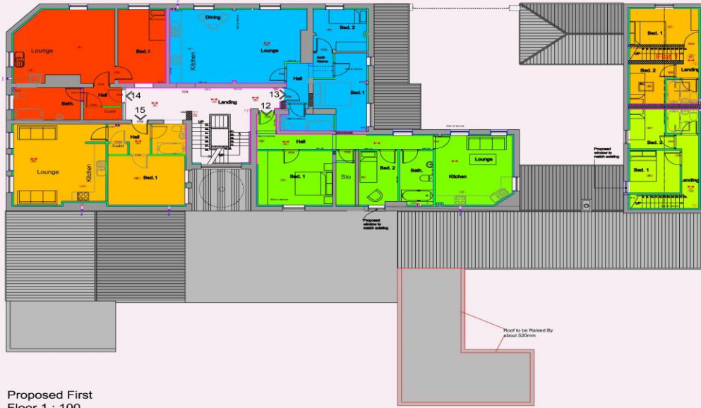
Proposed First Floor 1 : 100