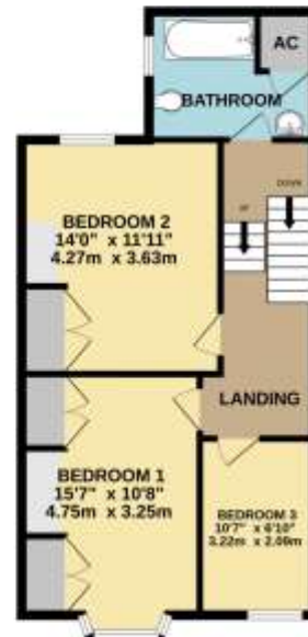
TOTAL FLOOR AREA: 1366 sq ft (126.7 sqm) approx.

While every attempt has been made to ensure the accuracy of the description contained herein, measurements of plots, setbacks, floors and any other details are approximate and no responsibility is taken for any error, omission or mis-statement. This plan is for illustrative purposes only and should be used as such by any prospective purchaser. The services, systems and appliances shown have not been tested and no guarantee as to their operability or efficiency can be given. Made with Hologix 11/2018