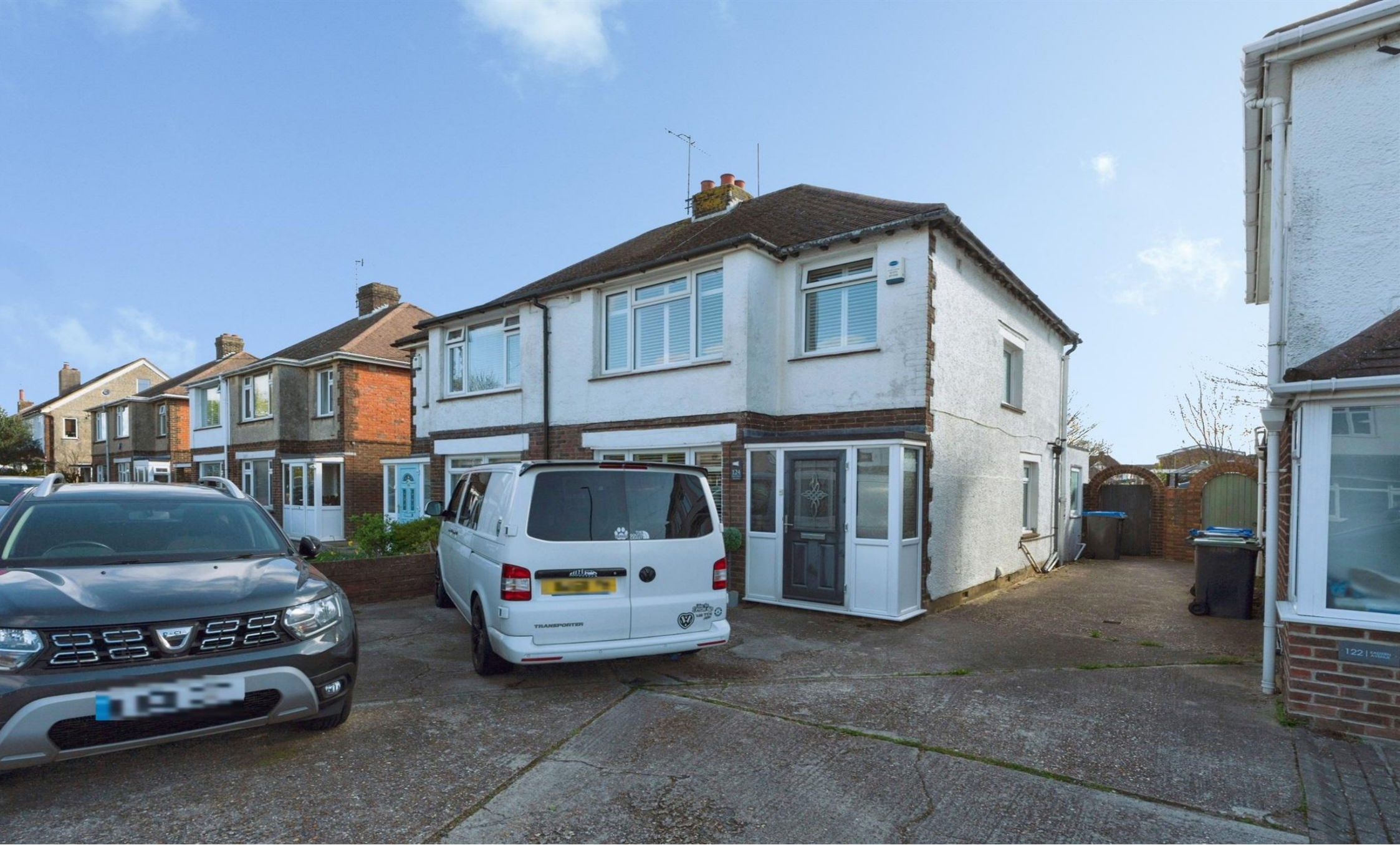
Eastern Avenue, Shoreham-By-Sea BN43 6PE