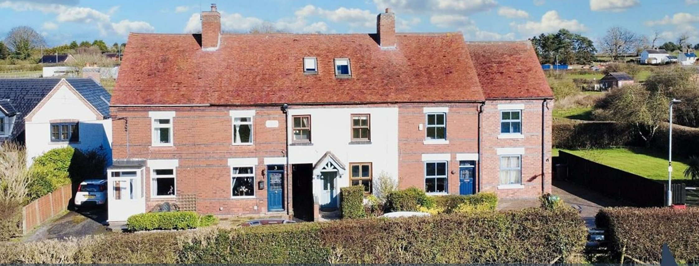
Lily Cottages Clay Lane Coleorton, Coalville, LE67 8JE