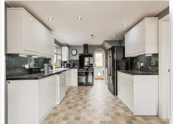
Hayfield Road, Minehead, TA24 6AD