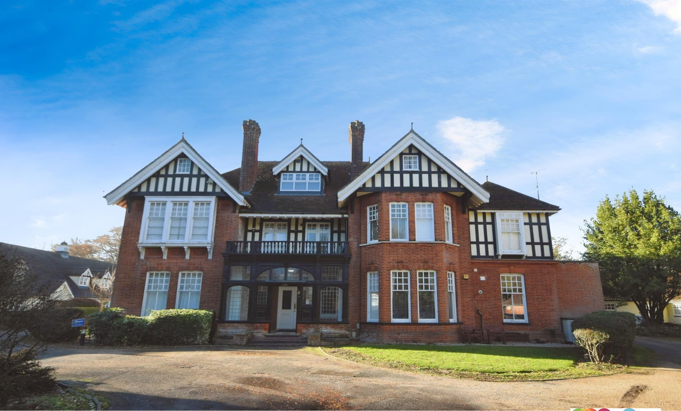
Monken Hadley House, Monken Hadley, BRAINTREE, CM7 5GQ