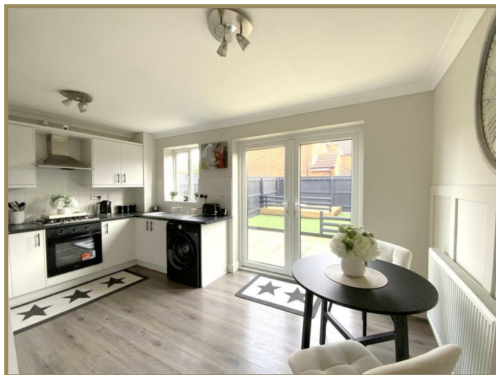
16 Deene Close, Grimsby, North East Lincolnshire, DN34 5XB £165,000