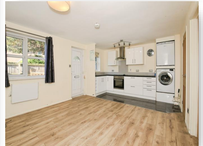
St. Martins Street, Peterborough PE1 3BB