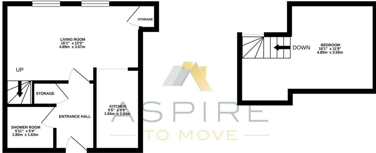
MEZZANINE FLOOR 153 sq.ft. (14.2 sq.m.) approx.