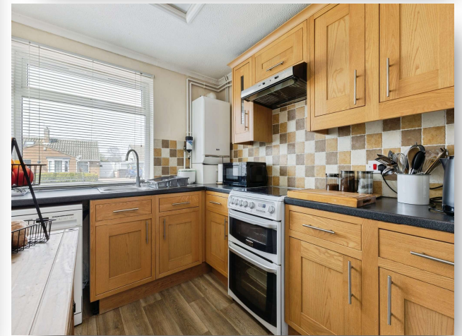
Meadow Way, Norwich NR6 6XX