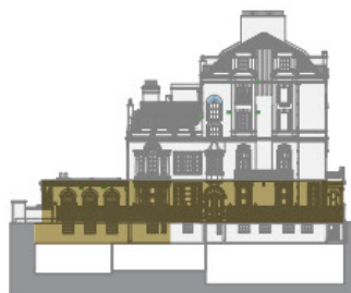
WALTON STREET ELEVATION