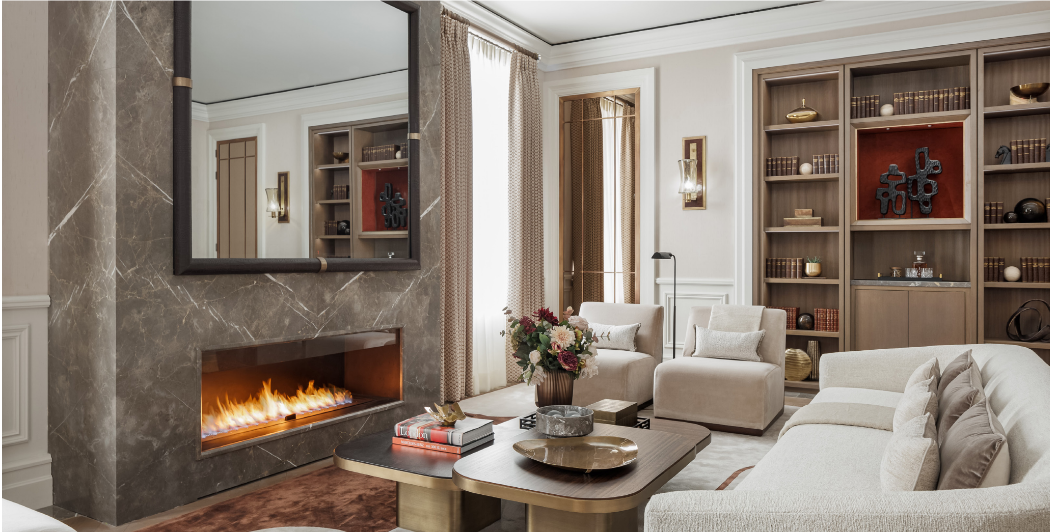
PONT STREET, Knightsbridge SW1X