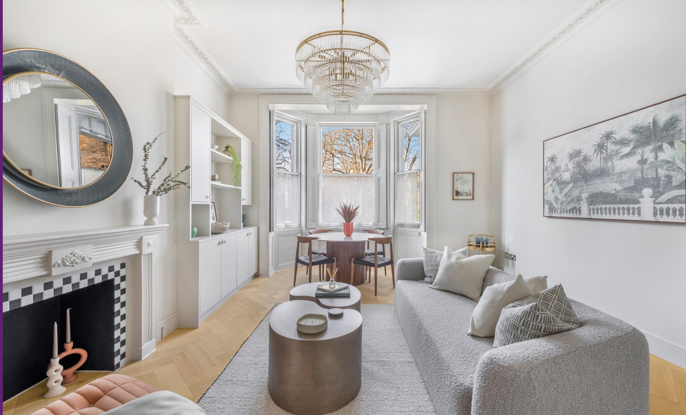
Colville Terrace Notting Hill, W11