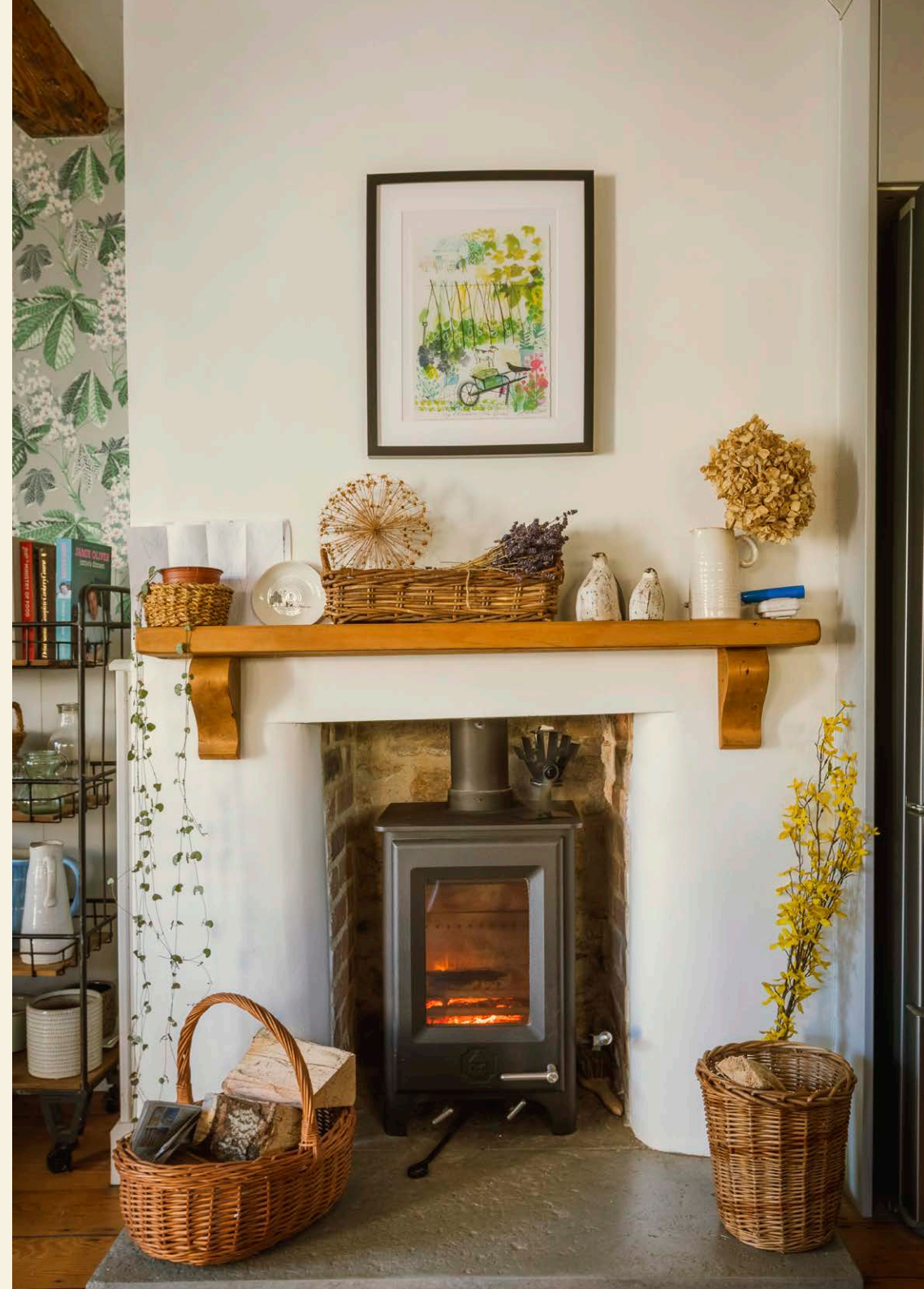
THE OLD STABLES, MERRIOTT