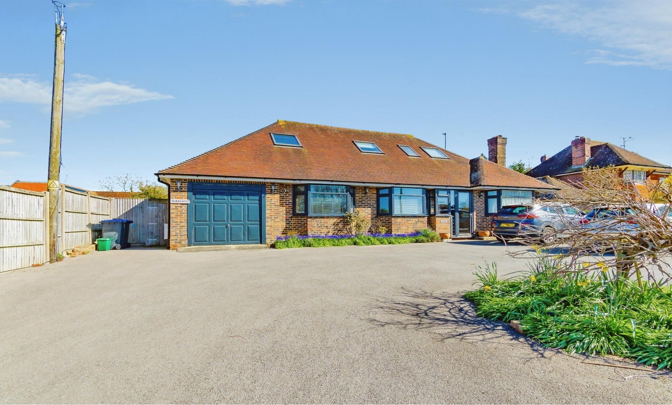
Sorrento Keymer Road, Burgess Hill RH15 0AN