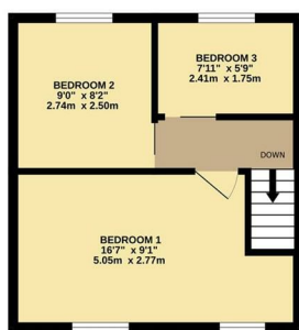
TOTAL FLOOR AREA: 706 sq.ft. (65.6 sq.m.) approx. Whilst every attempt has been made to ensure the accuracy of the floorplan contained here, measurements of doors, windows, rooms and any other parts are approximate and no responsibility is taken for any error, omission or mis-statement. This plan is for illustrative purposes only and should be used as such by any prospective purchaser. The layout, dimensions and any details shown here are not deemed to be a guarantee as to their availability or otherwise on the ground. Made with Metaplan 2020