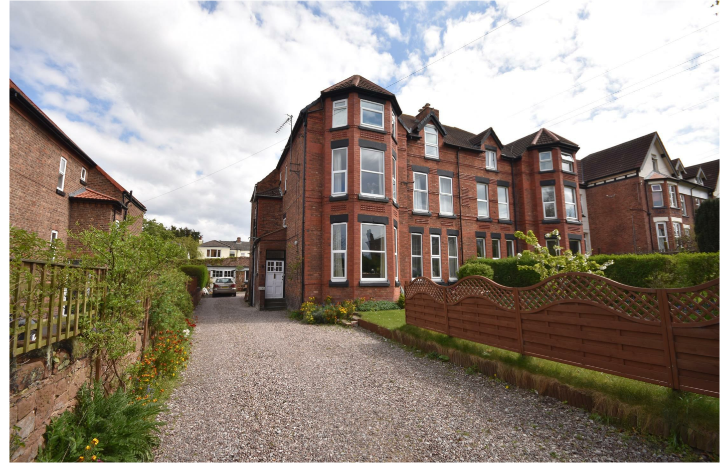
Second Floor Flat