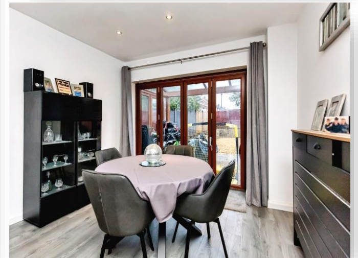
Beaufort Drive, Barton Seagrave Kettering NN15 6SF