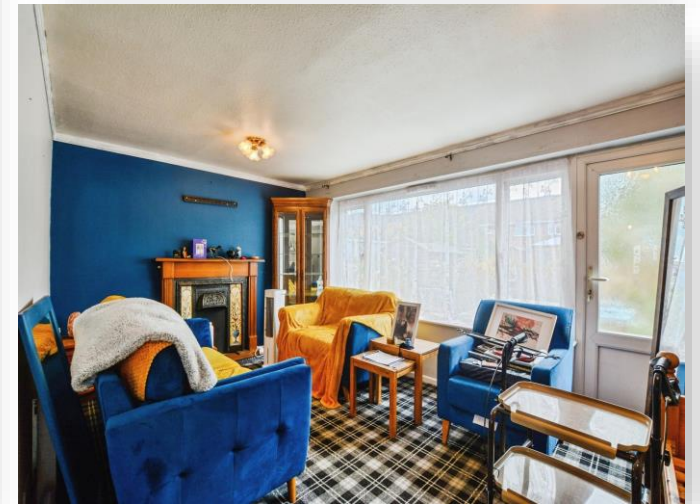
Barnes Road, Skegness PE25 2PR