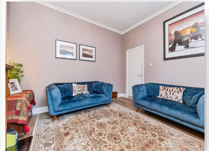
Montague Street, Hartlepool, TS24 0NH