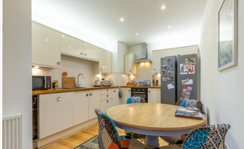
Open Plan Living/Dining/Kitchen

Anti-Money Laundering Regulations (AML) Please note that when an offer is accepted on a property, we must follow government legislation and carry out identification checks on all buyers under the Anti-Money Laundering Regulations (AML). We use a specialist third-party company to carry out these checks at a charge of £60.00 (inc. VAT) per individual or £50.00 (incl. vat) per individual, if more than one person is involved in the purchase (provided all individuals pay in one transaction). The charge is non-refundable, and you will be unable to proceed with the purchase of the property until these checks have been completed. In the event the property is being purchased in the name of a company, the charge will be £150 (incl. vat).