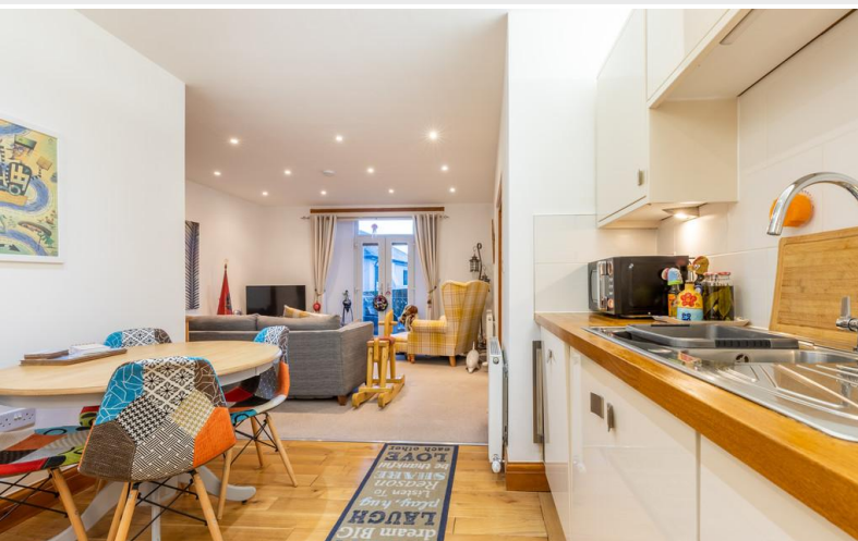
Open Plan Living/Dining/Kitchen