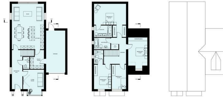
PROPOSED GROUND FLOOR Total GIA CIRCA-182.0m 2 (1,957sq. ft) Excl Garage Total GIA-208.0m 2 (2,239sq.ft) Incl Garage

general notes © This drawing and all information it contains is copyright of Twenty-Nine Architecture and must not be copied or reproduced in whole or in part or used without express approval of the authors. The drawing is to be read in conjunction with all other relevant drawings and specifications. All dimensions to be checked on site prior to commencement of works and any discrepancies to be checked immediately. Do not scale from this drawing. Unless otherwise stated, all dimensions are in mm.