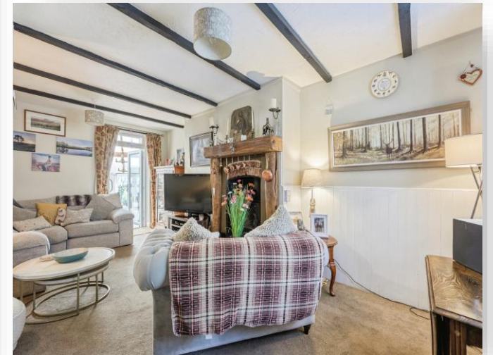
Coachmans Cottage, Plymouth PL7 5DG