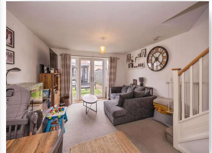
Down View Way, Clanfield, Waterlooville PO8 0FQ