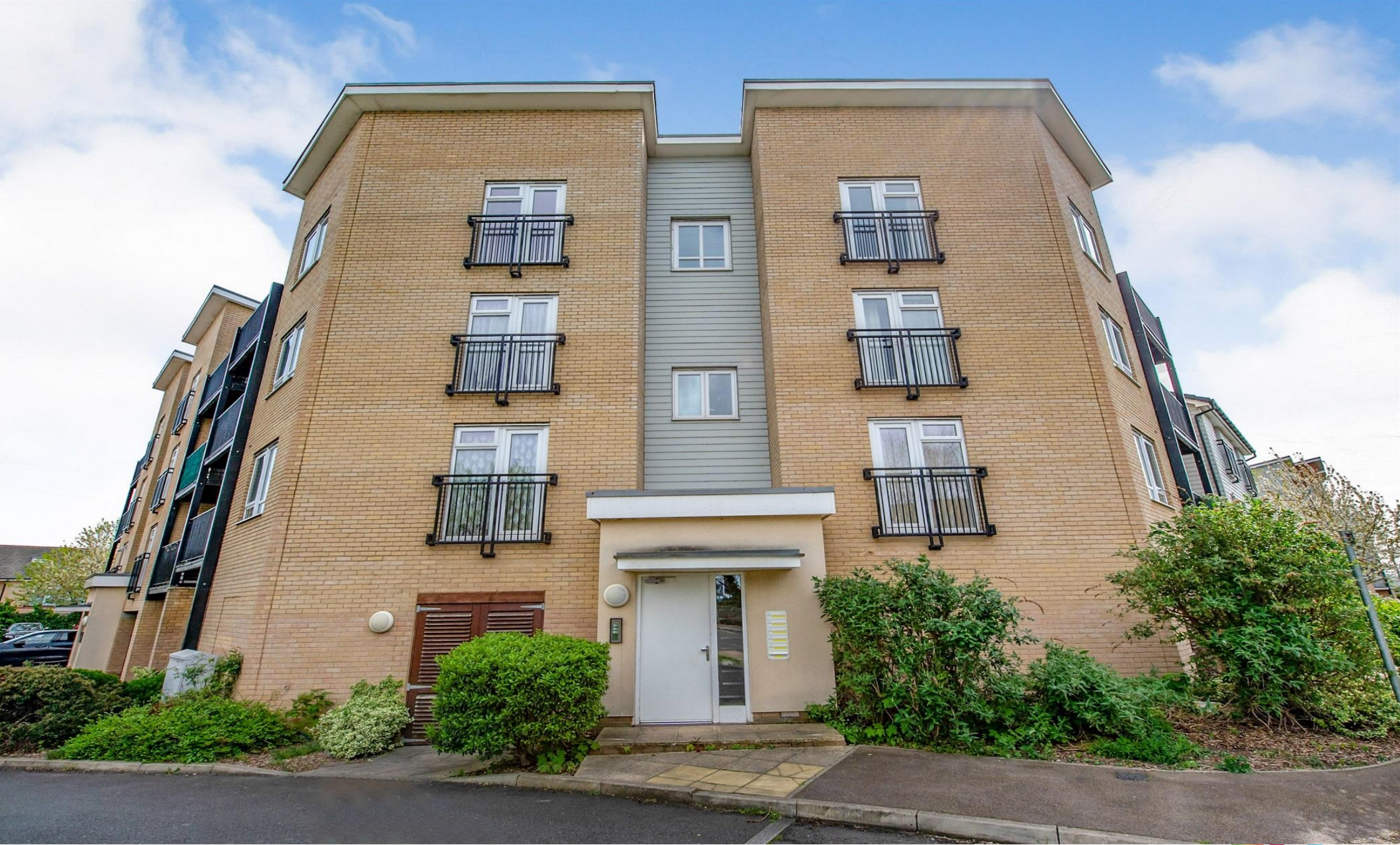
The Chase, Grays RM20 4BF