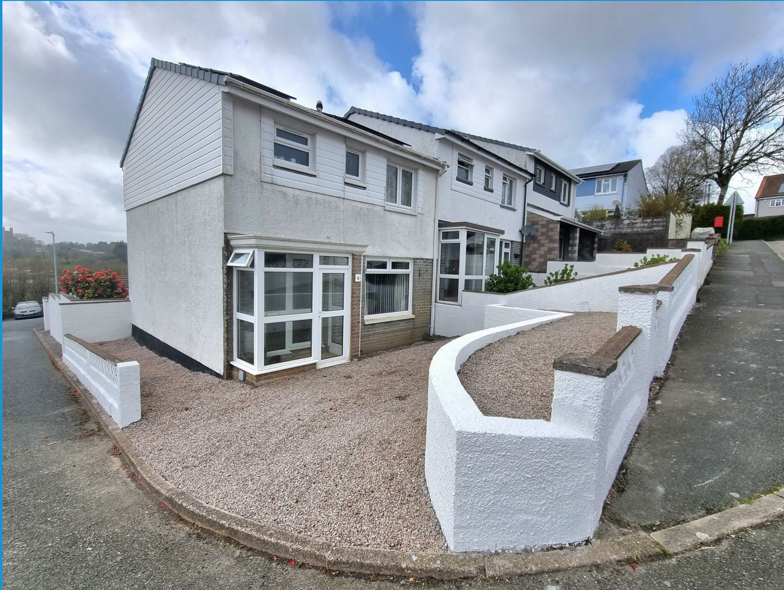
6 St. Marys Road Lanstephan | Launceston