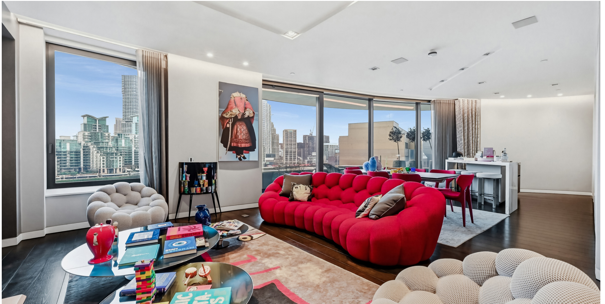
RIVERWALK, Westminster SW1P