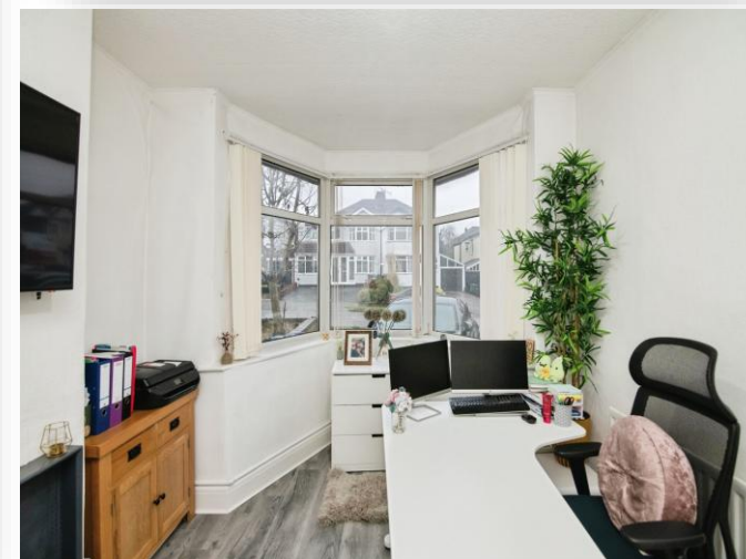
Stanley Road, Oldbury B68 0EH