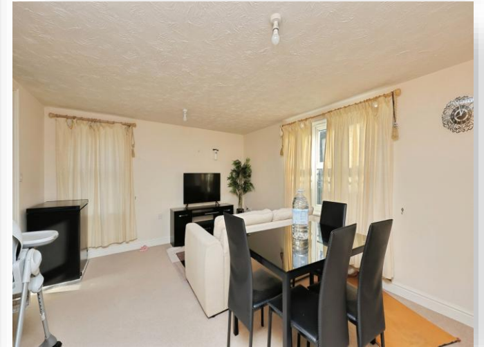
Caddow Road, Norwich, NR5 9PQ