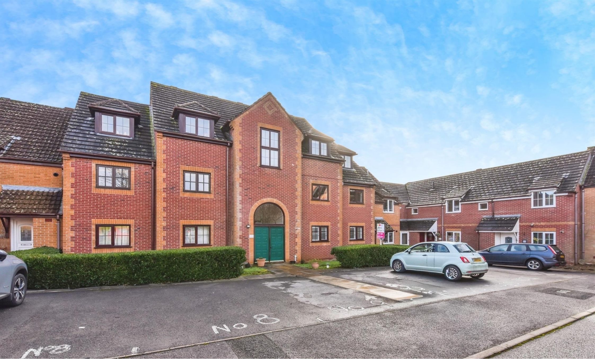
Morse Close, Chippenham SN15 3FY