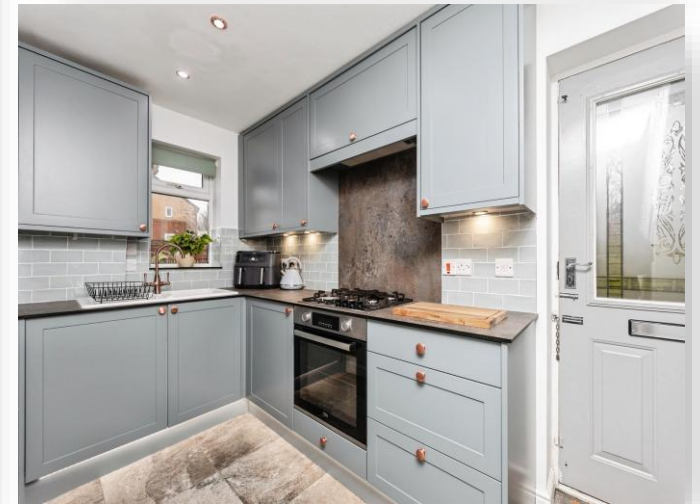
Kingfisher Mews, Morley Leeds LS27 8GT