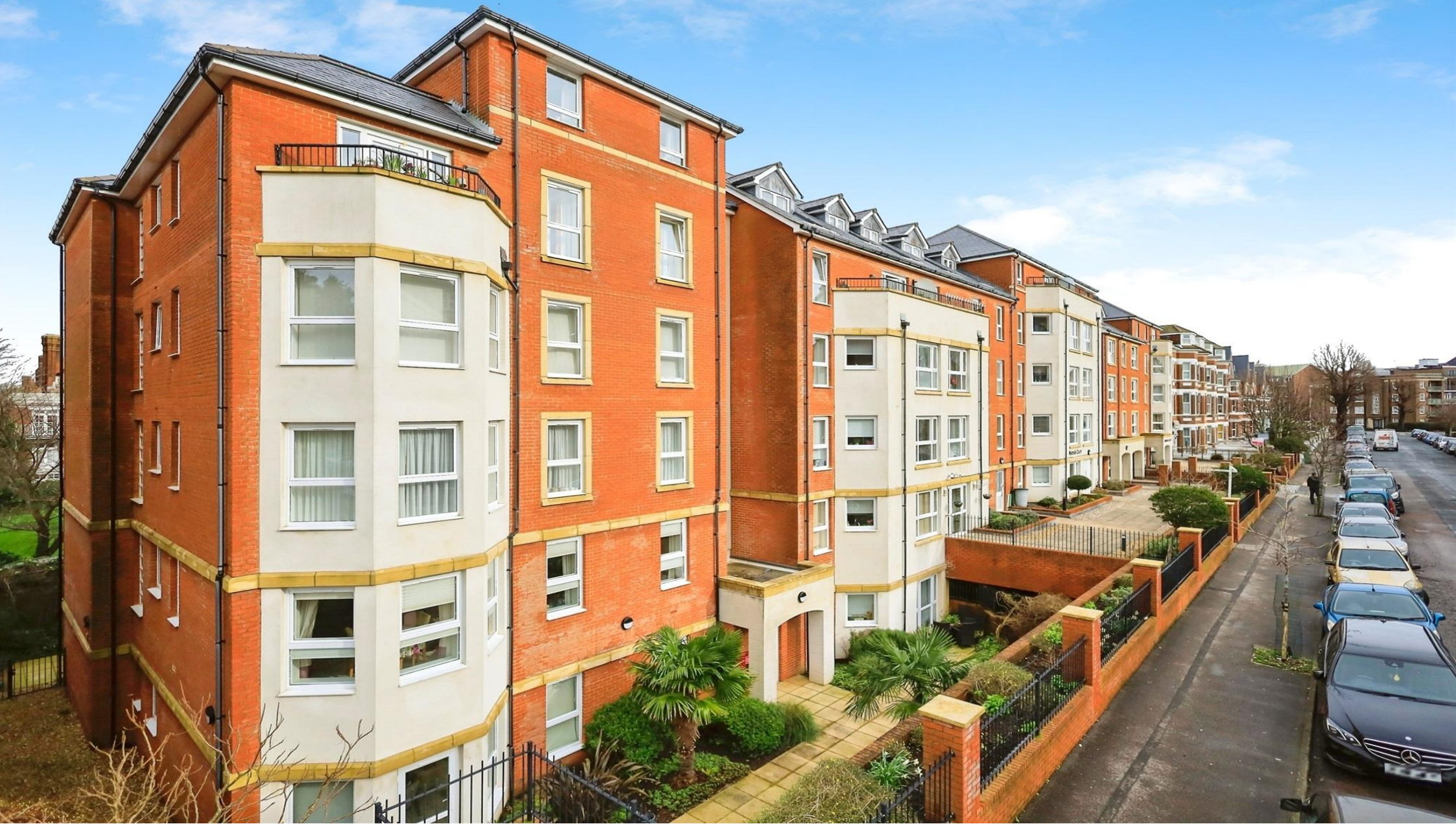
Martello Court Jevington Gardens, Eastbourne BN21 4SD