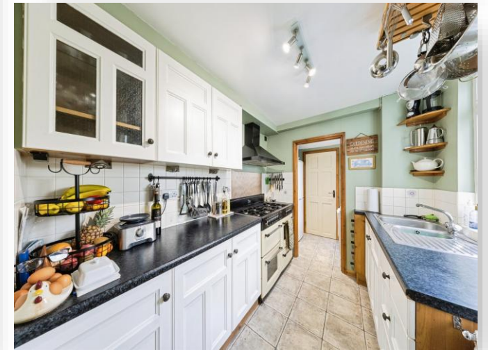
Greenfield Road, Newport Pagnell, MK16 8DB