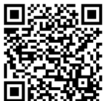
Illustration for identification purposes only, measurements are approximate, not to scale.

Whilst these particulars are intended to give a fair description of the property, their accuracy is not guaranteed. Any purchaser must satisfy themselves as to the correctness of statements contained therein. These particulars do not constitute an offer or contract, and statements therein are made without responsibility, or warranty on the part of the vendor or Trend & Thomas, neither of whom are liable to expenses incurred should the property no longer be available.