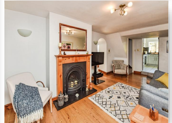
Hawkeridge, Westbury BA13 4LA