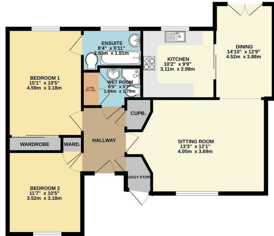
GROUND FLOOR 913 sq.ft. (84.8 sq.m.) approx.

TOTAL FLOOR AREA: 913 sq.ft. (84.8 sq.m.) approx. Whilst every attempt has been made to ensure the accuracy of the floorplan contained here, measurements of doors, windows, rooms and any other items are approximate and no responsibility is taken for any error, omission or mis-statement. This plan is for illustrative purposes only and should be used as such by any prospective purchaser. The services, systems and appliances shown have not been tested and no guarantee as to their operability or efficiency can be given. Made with Metropix 02025